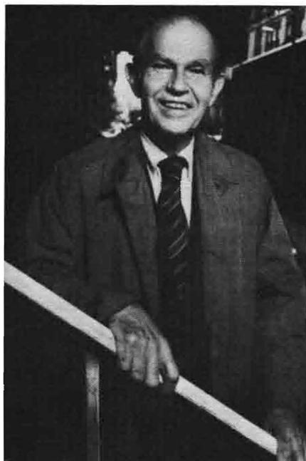
Hiss in 1977

Alger Hiss, the Grand Old Renegade, has been wearing a crown of thorns ever since he got out of Lewisburg Penitentiary in 1954. About a decade or so ago he really started living it up. He gets huge fees for denying his Red connections before college audiences; he was readmitted to the Massachusetts Bar (Stalinist shysters are admitted; Watergaters are not); he maintains a swank summer house in the Hamptons on Long Island; he is lionized by many of his old Stalinist and liberal sidekicks. Passing secrets to Russia is not too bad a business, if you pal around with Supreme Court Justices and don't mind a few years in the slammer. Last June, Alger, now in his